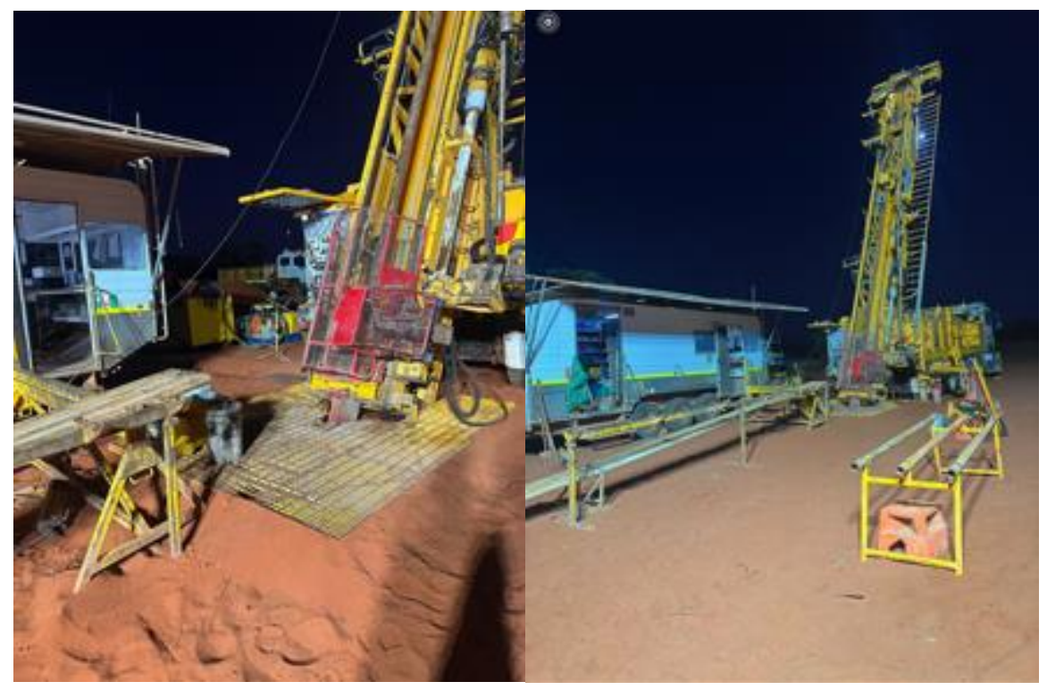
Figure 2: Diamond drilling at the Abercromby Project commenced on 3 December 2024.