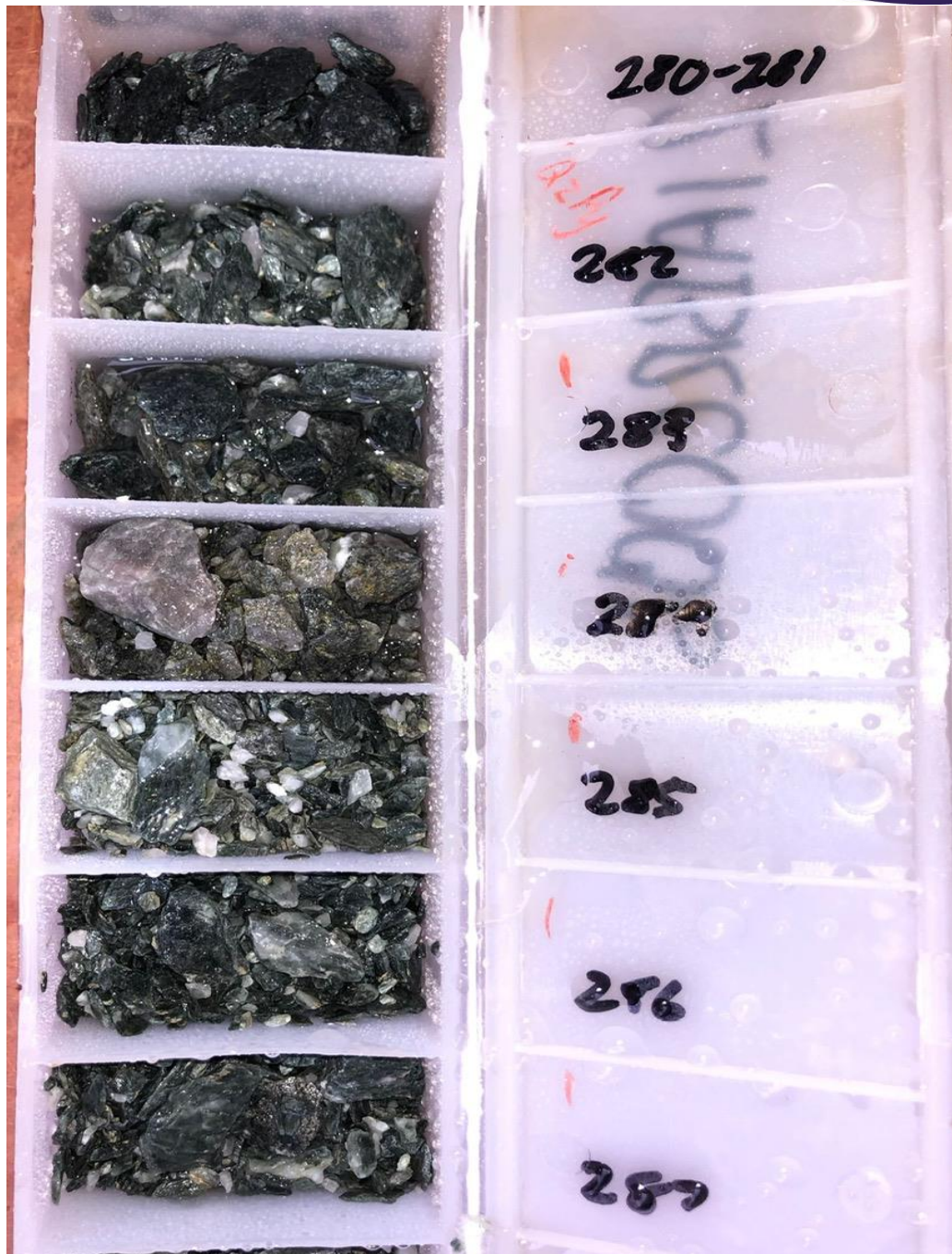
Figure 2 – Representative Sample Chips of Mineralised Alteration Zone (21ABRC006 280m to 287m downhole).

The Company is awaiting receipt of laboratory assays to confirm the extent of any gold mineralisation intersected, with first assays expected by mid-September 2021.